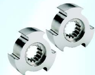
Tri-Wing Rotors optional