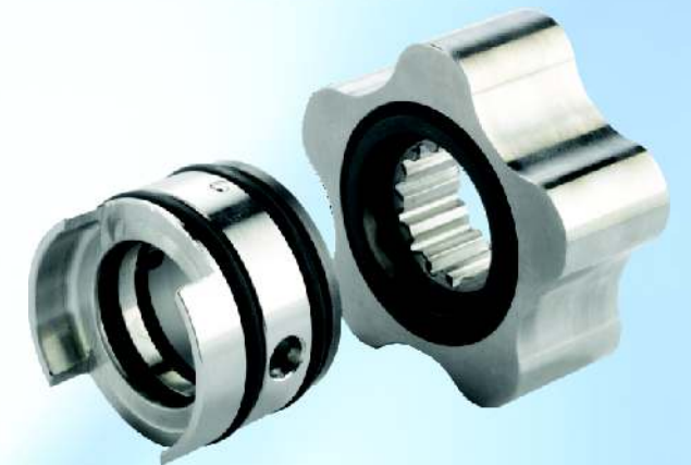
Multi-Lobe Rotor with Single Mechanical Seal.