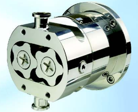
Profiled front cover joint and self draining rotorcase.