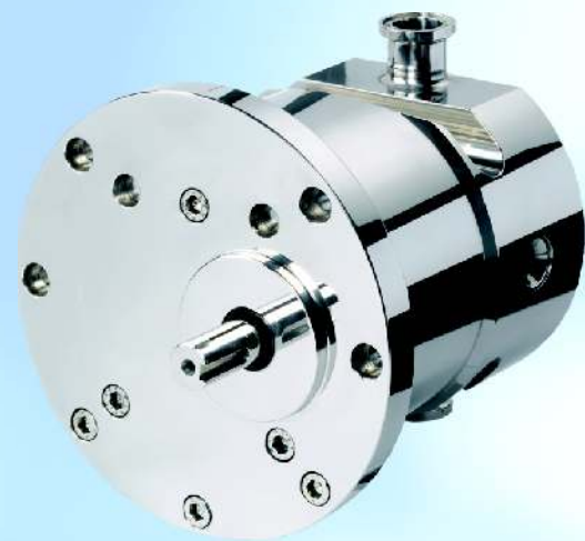
Drive shaft and bulkhead mounting register.