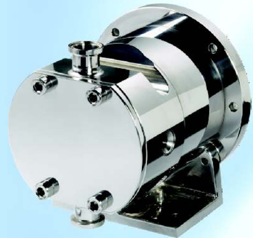
The AccuLobe Pump showing foot mounting bracket.