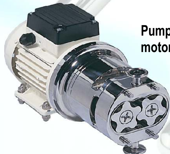
Pump mounted on motor.